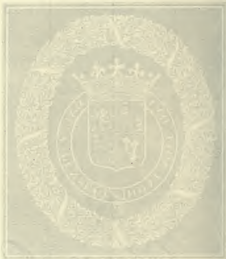
EMBLEM OF THE UNIVERSITY OF CAMBRIDGE